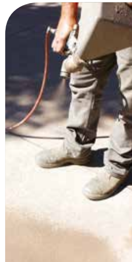
Hopper gun application of Stylepave.

Due to its great versatility in enabling multiple colours and designs to be incorporated into the project, it is becoming the system of choice for commercial and residential decorative concrete applications.