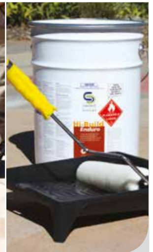
Two coats of a clear CCS Sealer provides protection against dirt and grime